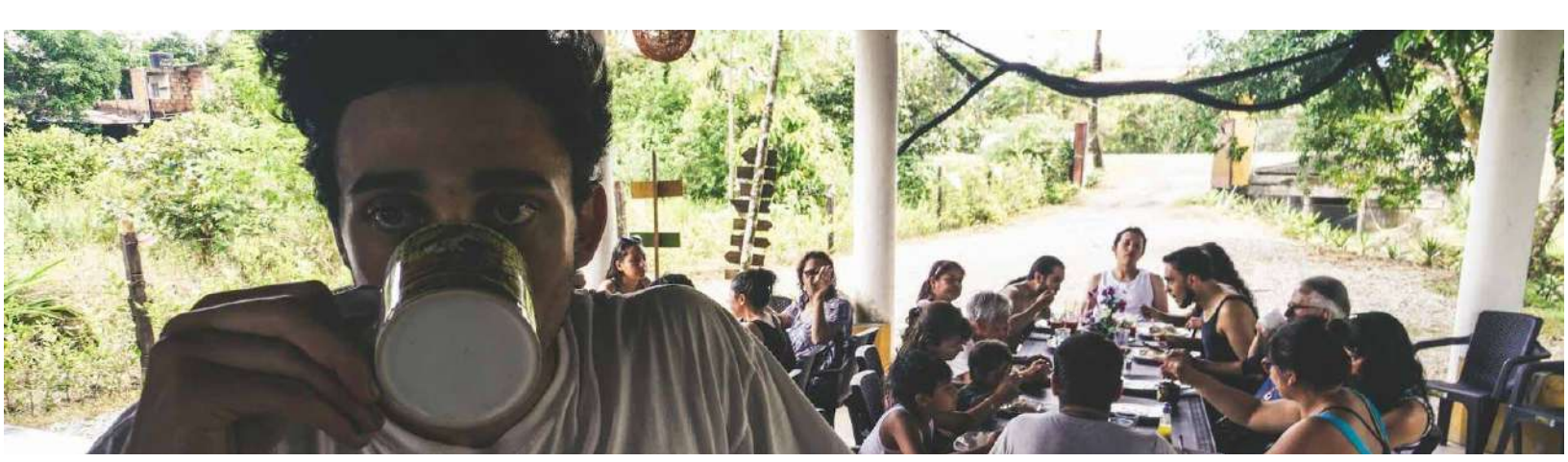
Depending on the season, we might need help in the Guesthouse reception and bar.